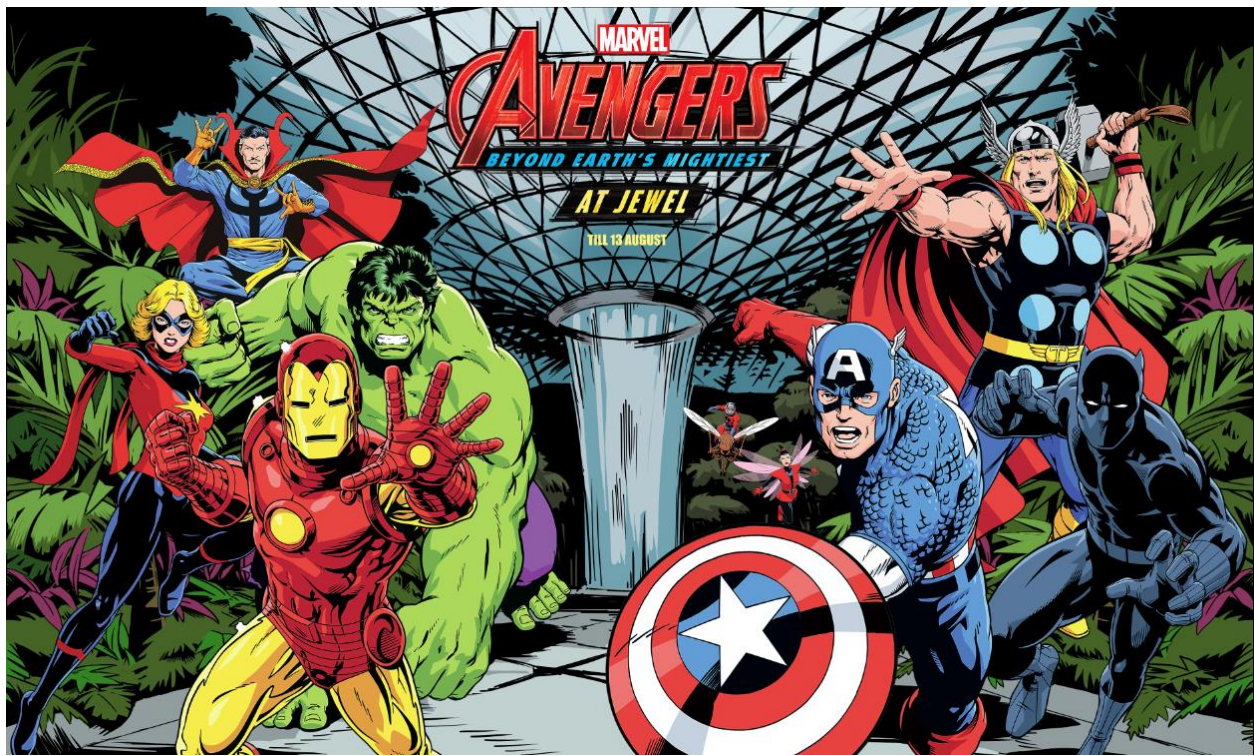
Avengers: Beyond Earths' Mightiest at Jewel will take place from 26 May to 13 August 2023

Singapore, 25 May 2023 – Fans and enthusiasts of The Avengers will be able to see Earth's Mightiest Heroes at a large-scale Marvel-themed event at Jewel Changi Airport (Jewel). Avengers Assemble @ Shiseido Forest Valley showcases some of the popular Avengers with 3D installations and interactive displays. Avengers Forever @ Canopy Park pays homage to 60 years of Avengers by featuring key milestones of the Avengers from comic books to television, toys and movies. The entire event – Avengers: Beyond Earths' Mightiest at Jewel – will be held from 26 May to 13 August 2023.