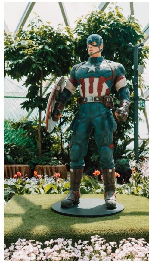
Life-sized statues of beloved characters from the Marvel Cinematic Universe await visitors at the Petal Garden within Canopy Park