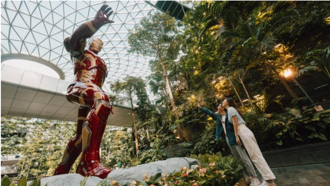
Be welcomed by a 5-metre tall Iron Man statue at the North Entrance of Jewel's Shiseido Forest Valley