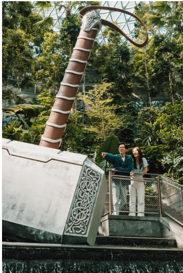
Marvel at the ginormous 3D displays featuring Captain America's indestructible Vibranium Shield and Thor's mighty Mjolnir

Against the backdrop of the lush greenery, visitors can snap their best superhero shot at six Marvel-themed photo spots including two mighty 3D displays – a 3-metre high Captain America's Vibranium Shield , and a 3.5-metre high Thor's Mjolnir (hammer).