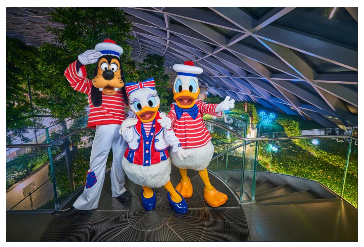
Goofy, Daisy Duck and Donald Duck at Hedge Maze, inspired by Disney Imagination Garden

Get free entry into Canopy Park on 16 and 17 November, when you come dressed in outfits inspired by your beloved Disney Cruise Line characters! All guests will also receive a complimentary Captain Mickey Mouse inspired head visor<sup>1</sup> during their visit.