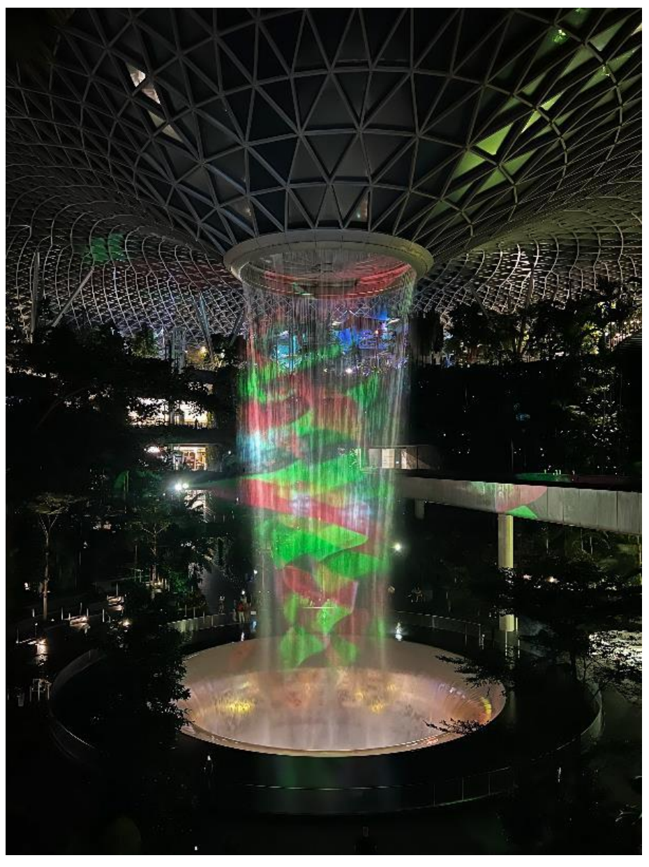
Christmas Light & Music Showcase

Every evening, the Jewel Rain Vortex comes to life with the spellbinding Christmas Light & Music Showcase at 8.00pm and 9.00pm (Monday to Thursday), with an additional show on weekends (Friday to Sunday) at 10.00pm. This choreographed display features dancing lights that harmonise with timeless Christmas melodies, creating a symphony of colours and sounds. Stay on for the enchanting snowfall experience that will add to the holiday spirit every evening at 7.35pm, 8.05pm, 9.05pm, with an additional session on weekends (Friday to Sunday) at 10.05pm.