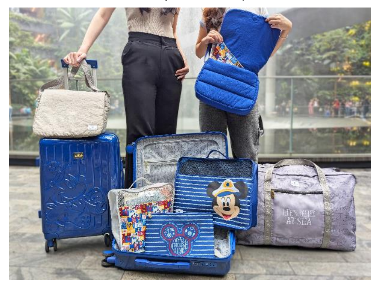
Don't miss out on exclusive Disney Cruise Line inspired collectibles

Multiple sessions planned across November and December 2024, at various timings<sup>2</sup>.