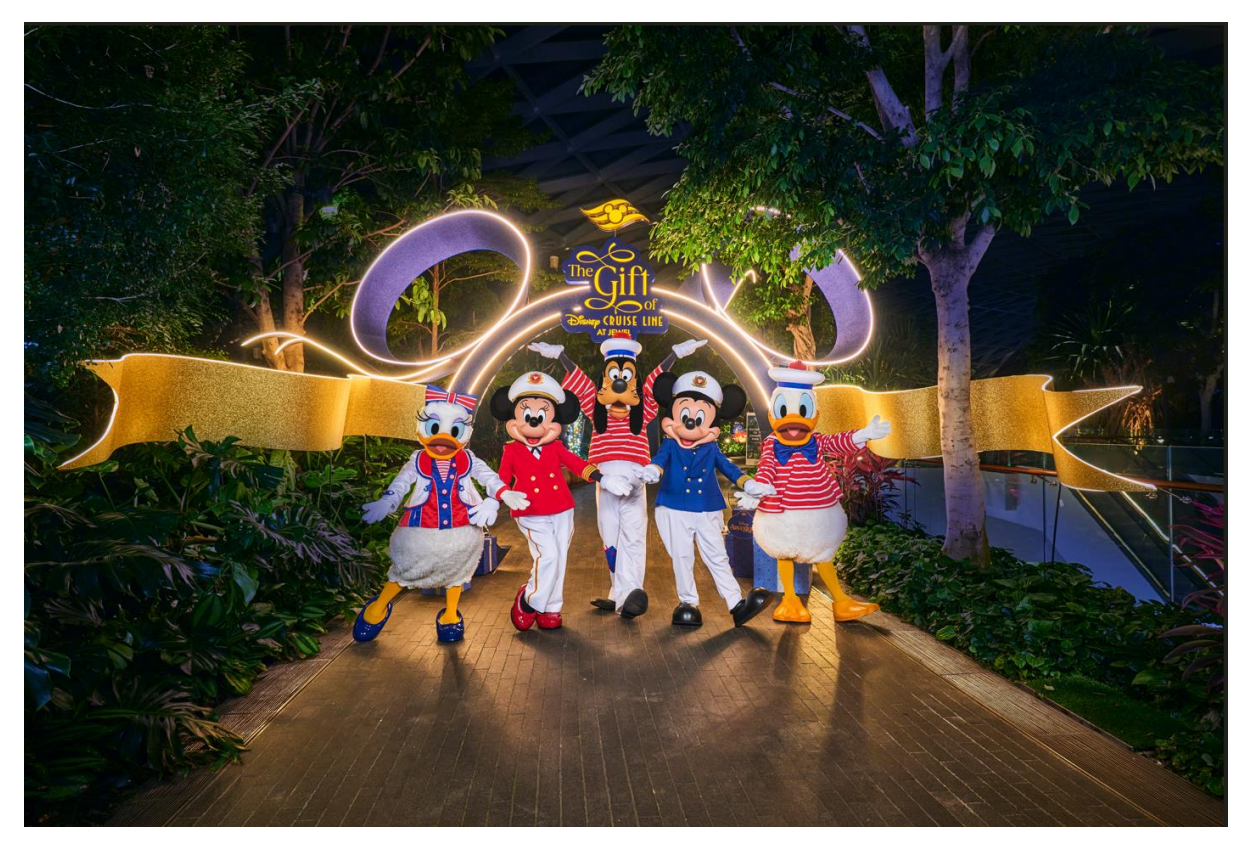
The Gift of Disney Cruise Line at Jewel featuring Disney Cruise Line's Captain Mickey Mouse and his crew